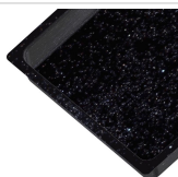
Enameled GN container